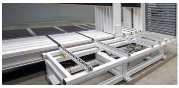
Manuel carcass erecting device : The carcass erector is used for erecting and transporting mounted carcasses.