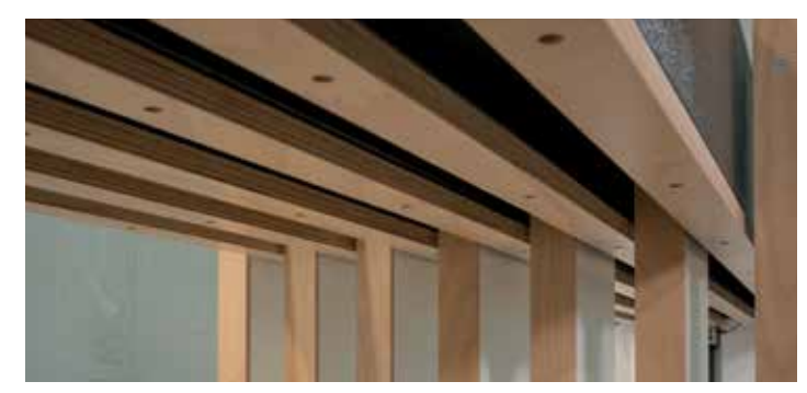
Pressing surfaces with tolerance compensation : The pressing lamellas work as a unit; they are placed on rubbers and suspended. Pressure is very evenly distributed due to the fact that the pressing lamellas simultaneously impinge on the carcass.