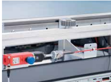
Equipment to achieve CE-conformity: rip cord back to the return belt