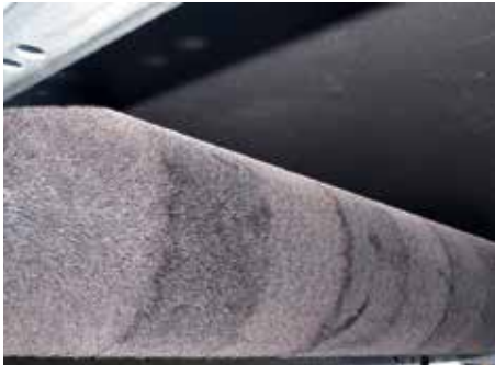
Belt cleaning equipment (option)