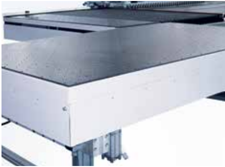
Lifttable air cushion table for outfeed (option)