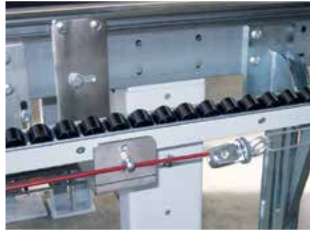
Small roller gib, lowerable (option)