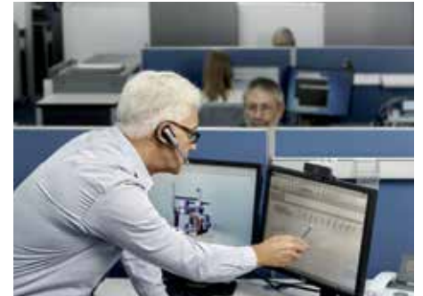
Remote Service: Excellent machine availability thanks to shorter periods of idle time and therefore lower production costs.